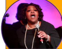
MINISTER GLADYS HAWKINS