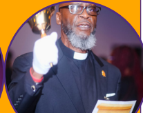
MINISTER EPSTEINE HENRY PRIESTLY BELL BEARER